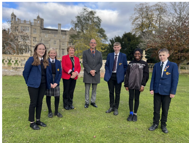
1 - Ofsted - Good with Outstanding Features!

I would like to wish our students, parents, carers and staff a happy and restful Christmas and look forward to seeing everyone back in school on Thursday 4th January.